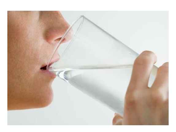
The day before your test, drink at least 8 glasses of water, milk, or juice.

Do not eat or drink anything that contains caffeine (including coffee, tea, chocolate, most soft drinks, and some medicines), nicotine, or alcohol. These substances will affect your test results.