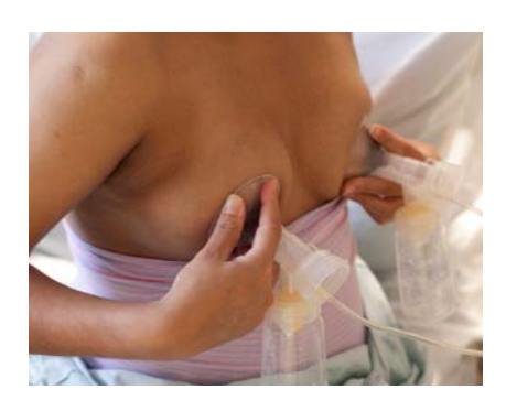
A breast pump will help you collect your breast milk quickly and easily.

To watch a helpful video about breast massage and hand expression, visit http://bfmedneo.com/our-services/breast-massage.