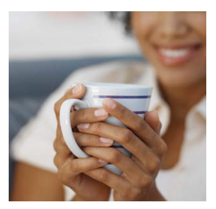
If you drink coffee, limit yourself to 2 servings a day while you are breastfeeding.