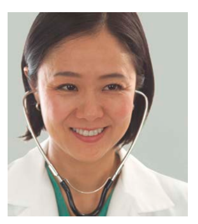
Talk with your healthcare provider about taking cold medicines while you are breastfeeding.

• Acetaminophen (Tylenol and other brands): Only small amounts of acetaminophen get into breast milk. The AAP says it is OK for breastfeeding mothers to use acetaminophen.