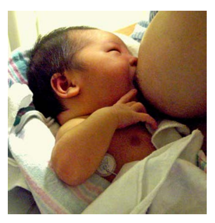
Some recreational drugs, medicines, and other substances might affect your breast milk and breastfeeding.

• Do not breastfeed for 3 hours after having 1 drink. "1 drink" is 4 ounces of wine, 12 ounces of beer, or 1 ounce of hard liquor.