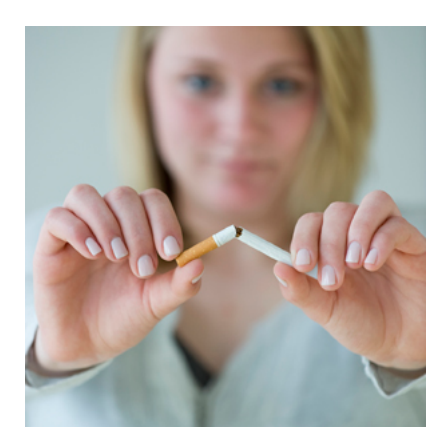
If you smoke, it will harm your baby, both before and after birth.