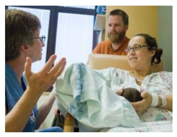
During your stay in the Mother Baby Unit, your nurse will talk with you about caring for yourself and your new baby.

Teach-back tells us if we have done a good job of sharing information. Teach-back sessions are also a great time for you to ask your nurse any questions you have.