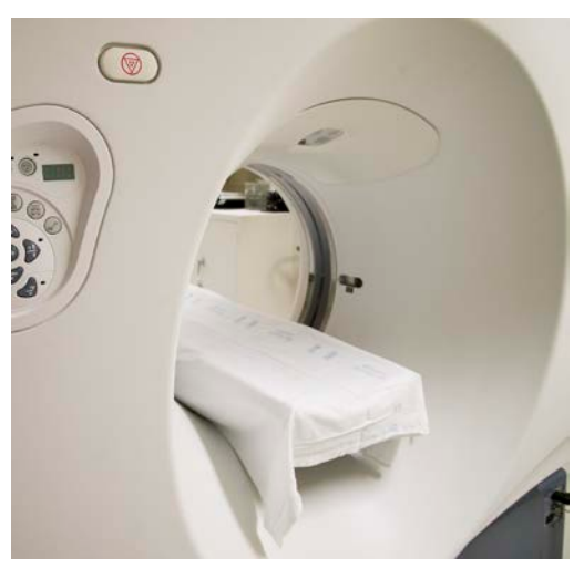
During your scan, you will lie on a table inside a CT machine.

A CT (computed tomography) scan of the abdomen uses a special X-ray machine to take detailed pictures of the inside of the abdomen. CT scans show many types of tissues and organs in the same image, such as the liver, spleen, pancreas, kidneys, gastrointestinal (digestive) tract, colon, and rectum.