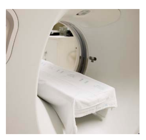
During your exam, you will lie on a table inside a CT machine.

During the exam, you will lie on a table inside a CT machine. Many X-ray beams will be passed through your abdomen at different angles. The X-ray tube will take pictures as it revolves around you. The pictures show cross-section images ( slices ) of the area. Your doctor will view the pictures on a computer.