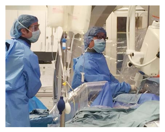
During your cerebral angiogram, your doctors will view X-ray images of your blood vessels on a monitor.

Your doctor requested this procedure because it gives much more detailed information than magnetic resonance imaging (MRI) or computed tomography (CT) scans.