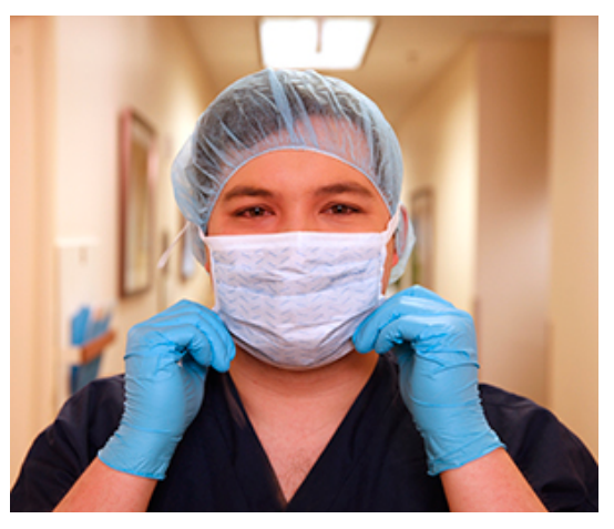
Anyone who has been exposed to chickenpox should wear a mask to keep from spreading the disease.

A person with chickenpox is contagious 1 to 2 days before their rash appears and until all blisters have formed scabs.