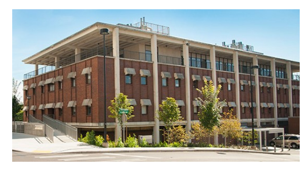
The Center on Human Development and Disability in Seattle, Washington

Please talk with your health insurance company. Ask what services they cover, what co-pays you will need to pay, and whether you need authorization before your clinic visit.