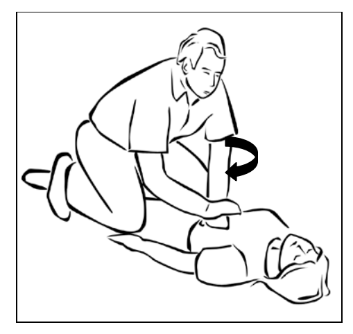
Heimlich maneuver on an unconscious adult

If the person does not start breathing on their own, start CPR and call 9-1-1.