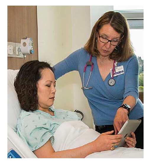
You will be recovering in the hospital for 3 to 5 days after your surgery.