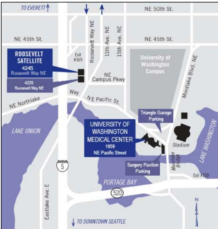
Area map showing UWMC, UWMC Roosevelt Clinics, and the Triangle and Surgery Pavilion parking garages