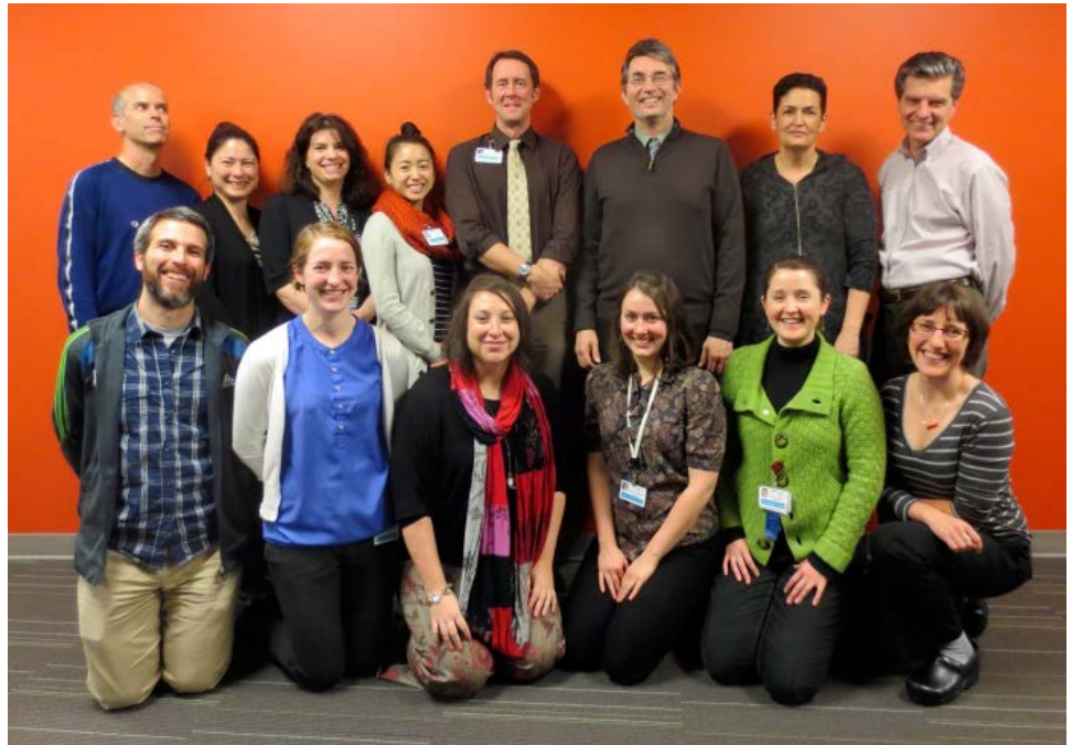
Some team members at the UW Medicine Memory and Brain Wellness Center

We also work with research teams at the Alzheimer Disease Research Center for Alzheimer disease and frontotemporal dementia, and the Pacific Northwest Udall Center for Parkinson disease.