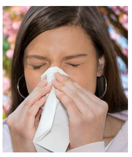
Measles can be spread when someone who has the disease sneezes or coughs.