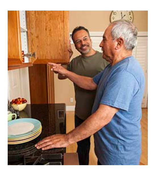
Every day, do tasks such as reaching for light objects from a shelf.