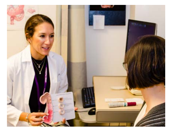
Talk with staff at UW Medicine Specialty Pharmacy 24 hours a day, 7 days a week.