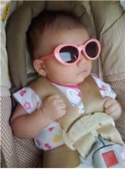
Use sunglasses to protect your child's eyes from bright sunlight.