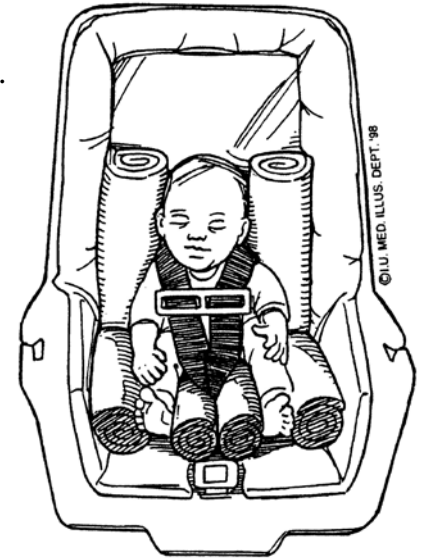
A baby in an infant car seat.