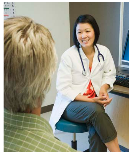
如有疑问请向您的医生请教如何收集 24 小时尿液