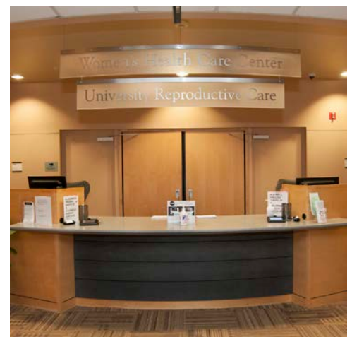
Check in at the front desk of the URC clinic for your appointment.