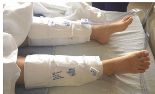
SCDs inflate from time to time to help blood circulate in your legs.