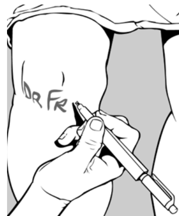
A surgeon writing their initials on a patient's surgery

If your site does not need to be marked, we will ask you to confirm what surgery or procedure you are having.