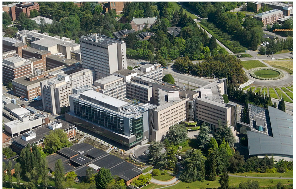
UW Medical Center - Montlake campus in Seattle, Washington