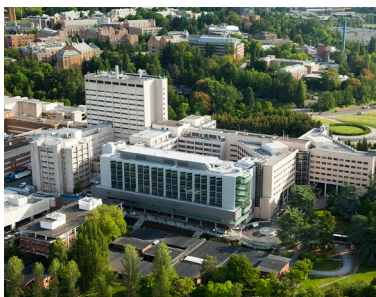
UWMC - Montlake campus is east of Interstate 5 and north of State Route 520.