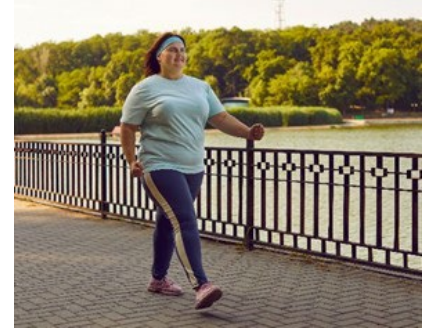
Walking is an important part of recovery after bariatric surgery.