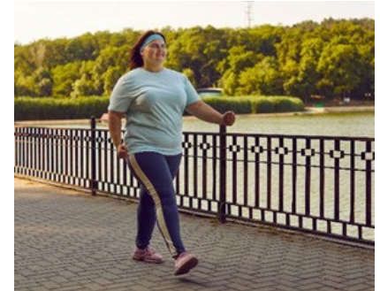
Walking is an important part of recovery after bariatric surgery.