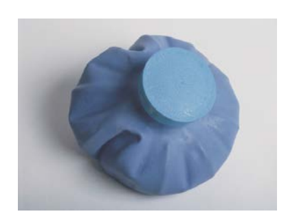
Use an ice or cold pack to reduce swelling after your oral surgery.