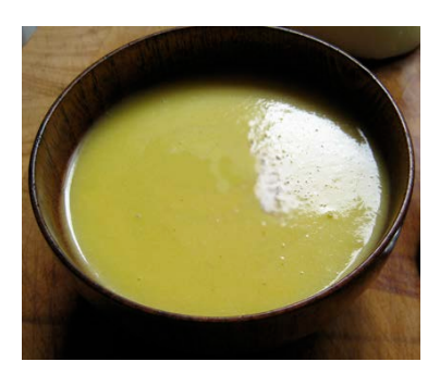
For 2 days after your surgery, you may have only liquids and soft foods, such as smooth soups.