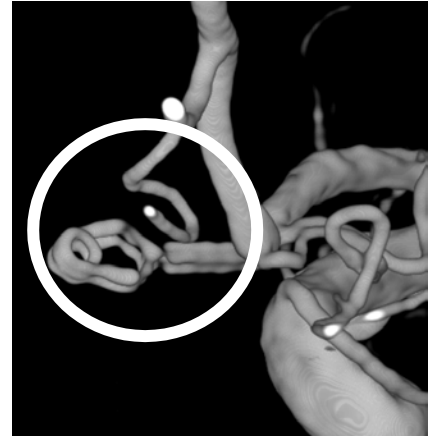
The circle shows the clip that is placed at the base of the aneurysm to close it.