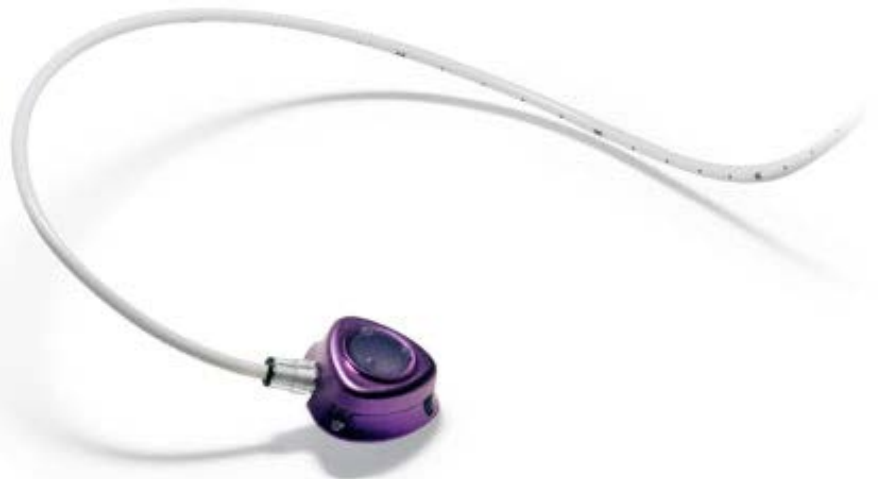
A chest port reservoir and catheter

You will have a thin scar 1 to 2 inches long on your skin. You will not be able to see the port and catheter. But, you may have a small bulge in your skin where the port is.