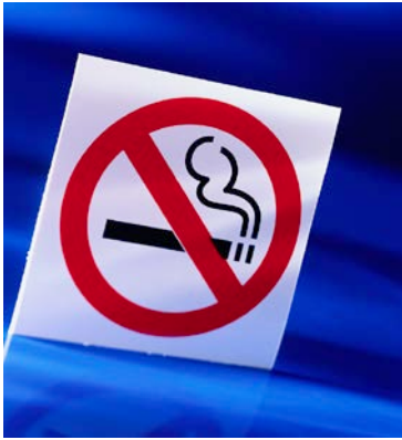
Smoking harms your baby, both before and after birth.