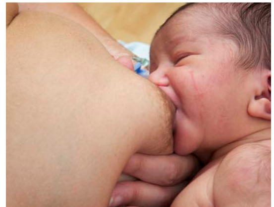
Nursing more often may help ease breast engorgement.