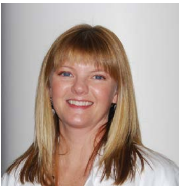
An advanced registered nurse practitioner (ARNP) works with your attending doctor to provide your care.

A resident is a licensed doctor in training, with 1 to 3 years of experience.