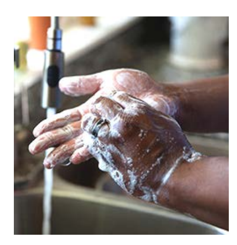
Wash your hands often with soap and water, for at least 20 seconds.