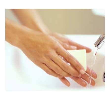
Wash your hands well with soap and warm water before and after you empty your drain.