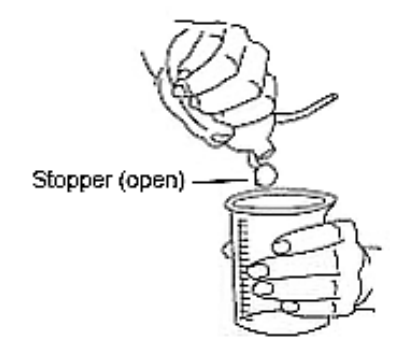
Turn the drain collection container upside down over the measuring cup. Gently squeeze the bulb to empty it.