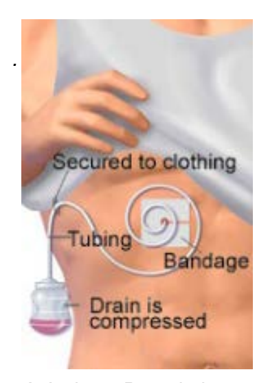
A Jackson-Pratt drain Drawing used with permission from Truven Health Analytics.