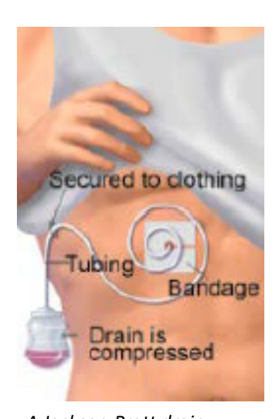
A Jackson-Pratt drain