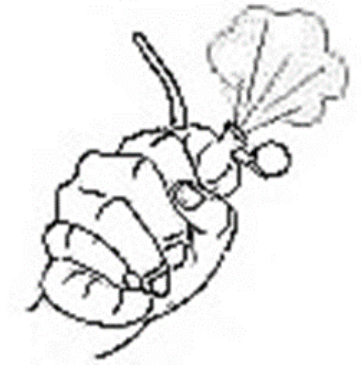
Squeeze the bulb flat with your hand before you replace the plug.