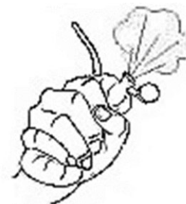
Squeeze the bulb flat with your hand before you replace the plug.