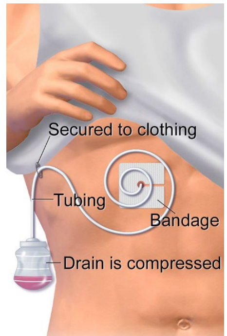
A Jackson-Pratt drain

Drawing used with permission from Truven Health Analytics.