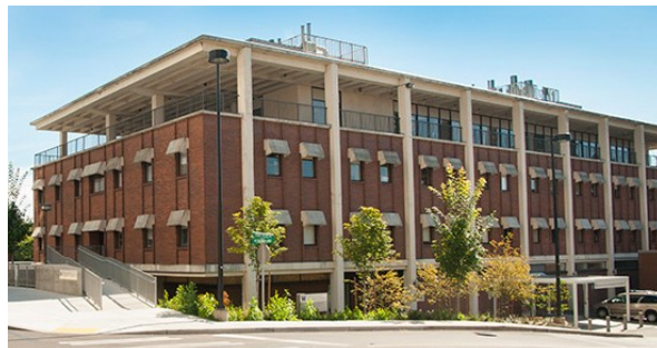
The Center on Human Development and Disability in Seattle, Washington

Please talk with your health insurance company. Ask what services they cover, what co-pays you will need to pay, and whether you need authorization before your clinic visit.