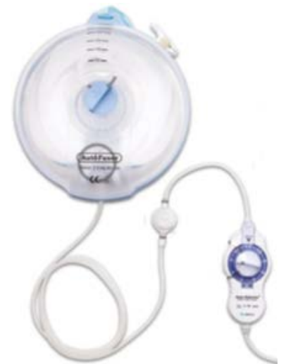
AutoFuser Disposable Pain Pump

After surgery, we will connect the catheter to a disposable pump. Inside the pump is a balloon filled with the pain medicine. This will provide pain relief for 3 days after your surgery.