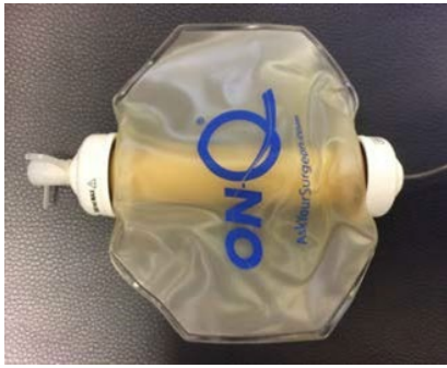
The pump when it is empty.