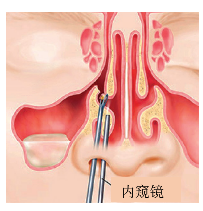
您的外科医生将使用一个称 为内窥镜的细管来清除鼻窦 中的障碍。

内窥镜手术无需在皮肤上做任何切口。而是、外科医生使用微小的仪器和 内窥镜 ,内窥镜是一根细小的软管,末端有灯光及摄像头。