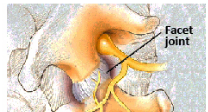
A facet injection delivers medicine into a facet joint.