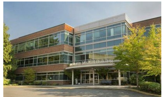
The McMurray Building at Northwest Hospital