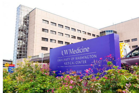
University of Washington Medical Center