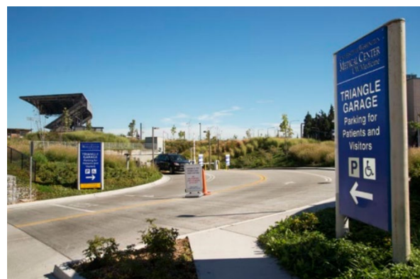
Entrance to the Triangle Garage