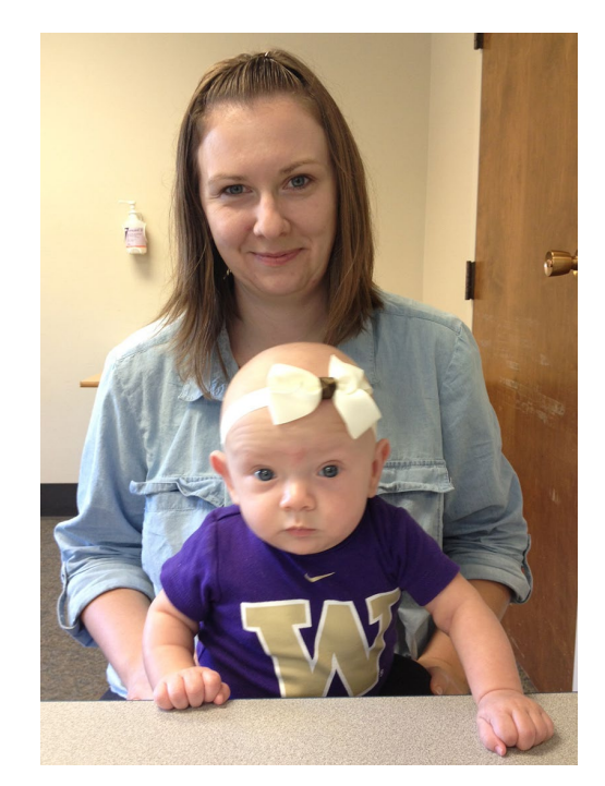
Every child is born with potential. Every child deserves the chance to achieve it. Our team can help.