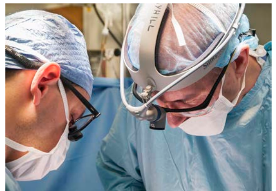
Transplant surgery is one possible treatment for kidney disease.

One treatment option for chronic kidney disease is transplant. To receive a kidney transplant, you must be close to needing dialysis or already be on dialysis. To qualify as a transplant candidate, you will need to have many tests. These can be coordinated by your healthcare provider or a transplant coordinator at the transplant center you choose.