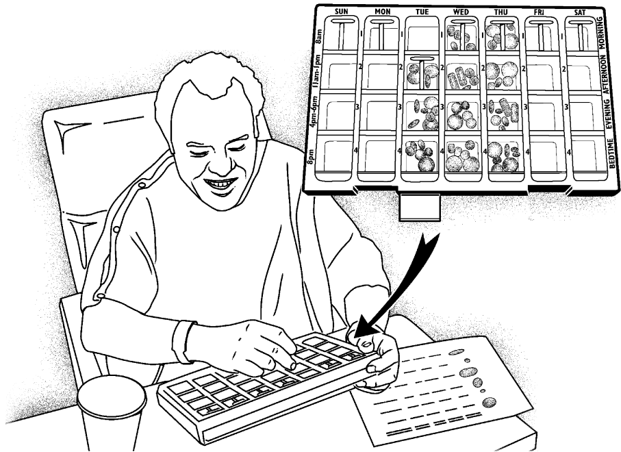
Figure 18: You will need to take many different medicines after having a kidney transplant. A pill organizer may help.