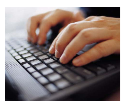
Always check with your doctor about any information that you read online about liver transplant.

www.transplants.org 800.489.3863 Email: info@transplants.org 5350 Poplar Avenue, Suite 430, Memphis, TN 38119