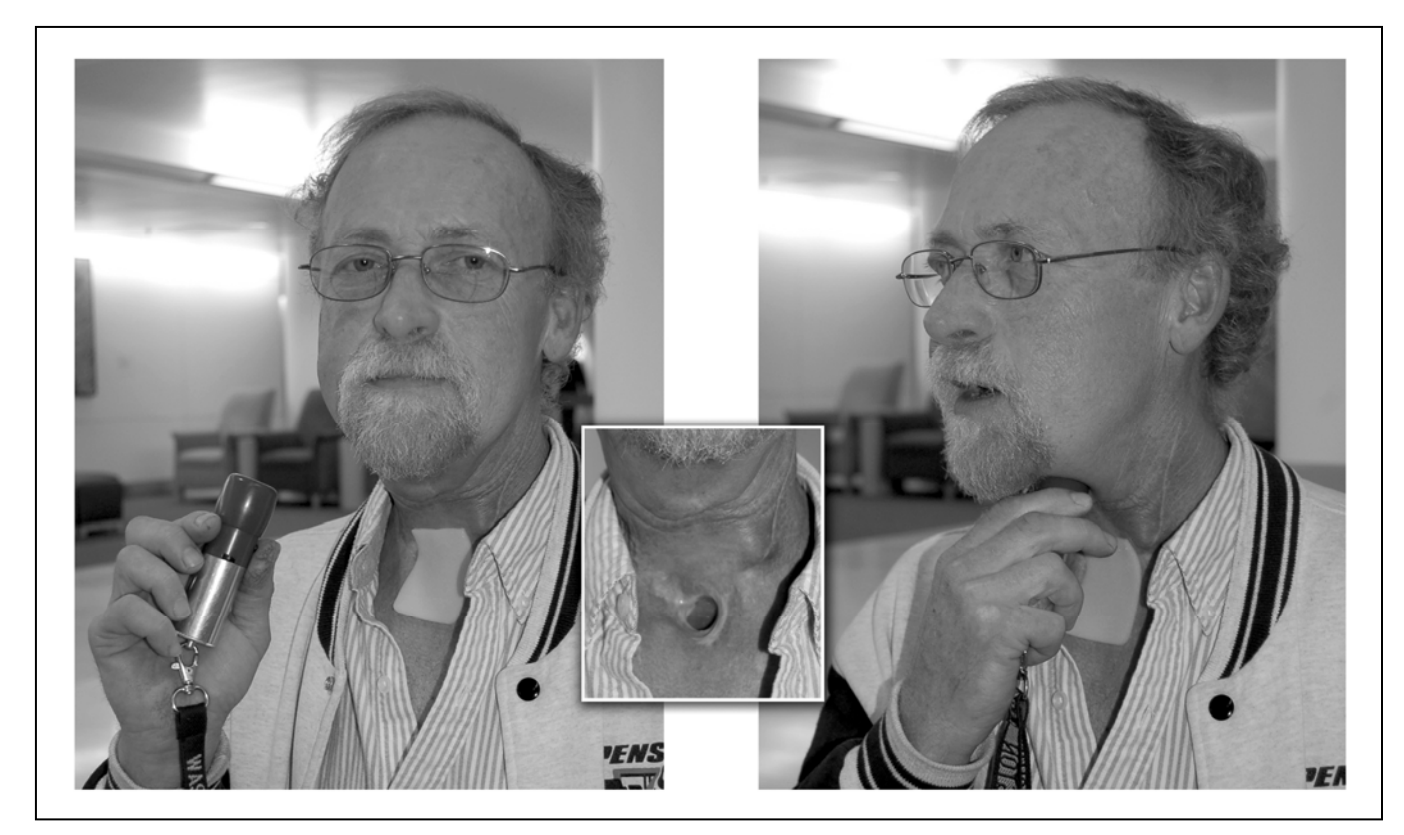
This patient is showing how he uses his Electrolarynx. His surgery was about 2 years ago.

One of the risk factors for developing head and neck cancer is cigarette smoking. While you are in the hospital, we will work with you to help you stop smoking, if needed. Our social worker has information on smoking cessation programs. Working with an organized program can support you as you make this lifestyle change.