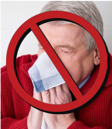
Do NOT blow your nose for 3 weeks after your surgery.

Your hearing may come and go during the first 4 weeks after surgery. You may hear cracking or popping in your ear. It may sound like your head is in a barrel. All of these things are normal.