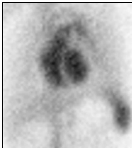
An image from a MUGA scan.

Here is an example of what a MUGA scan image looks like: