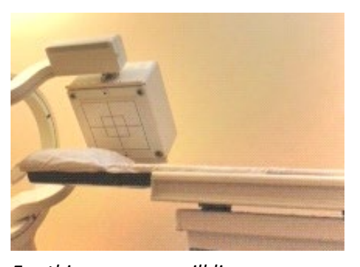
For this scan, you will lie on your back on an exam bed while the gamma camera takes images of your heart.

First, we will draw a small sample of your blood. We may use an intravenous line (IV), your port-a-cath, your peripherally inserted central catheter (PICC), or your Hickman line.