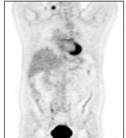
Dark areas show where tracer

Together, these scans help us see changes in your cells. These scans can help find cancer or tell us how cancer treatments are working.