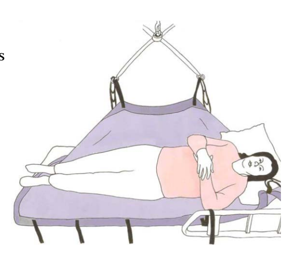
A ceiling lift may be used for turning.

• Your loved one will receive good nutrition and plenty of fluids. These are important for preventing and healing pressure injuries.