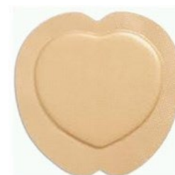
Sacral (tailbone) bandage