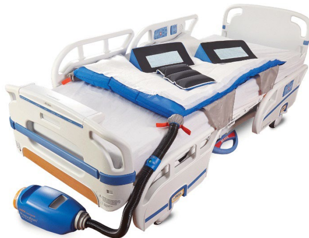
The AirTap is a gentle, air-powered mat that helps move patients safely and comfortably.